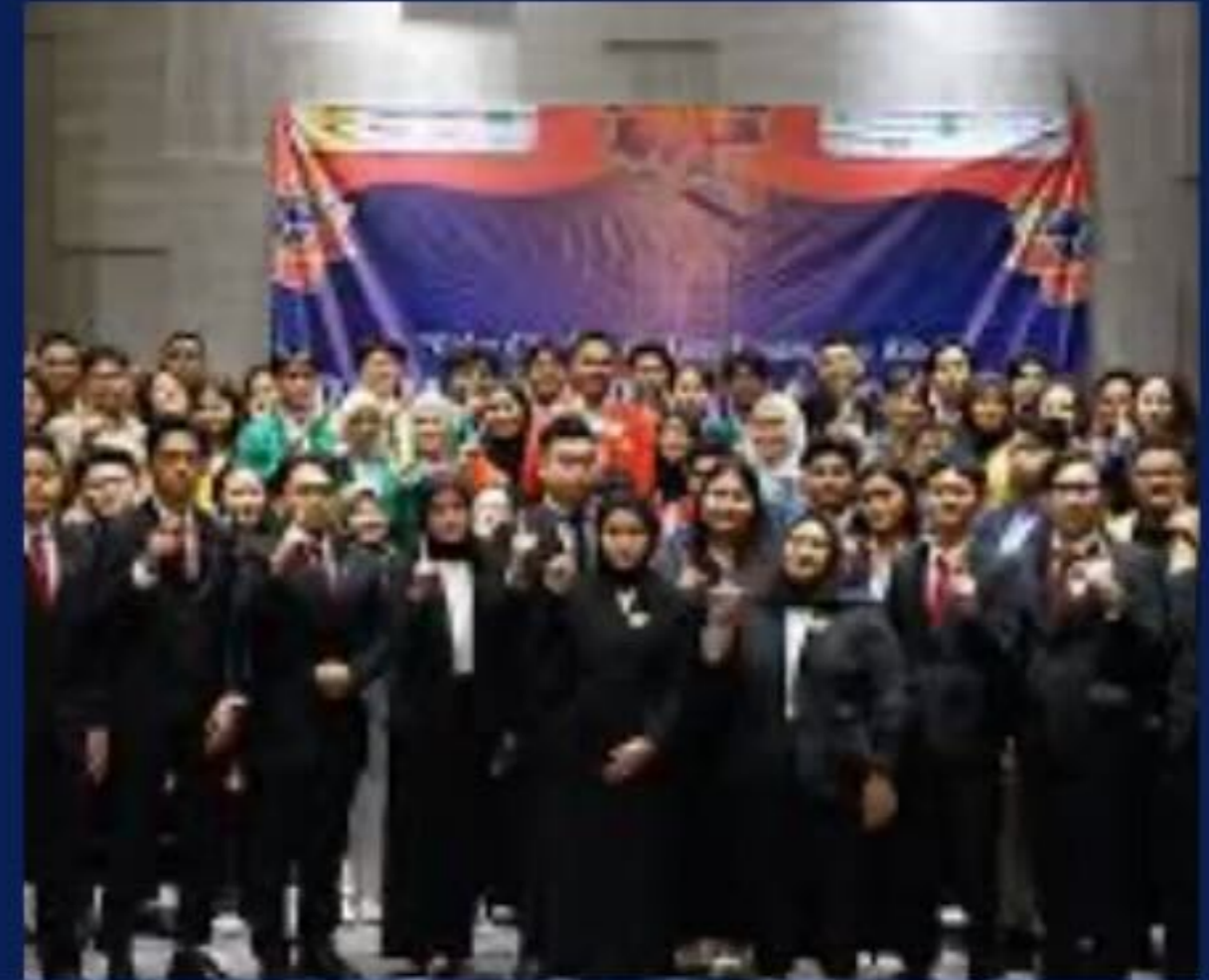
Rapat Pimpinan Nasional (Rapimnas)

Rapat Pimpinan Nasional is the first event of the new working term, typically held in May at the Local Chapter of the newly elected President. It brings together the ALSA National Chapter Indonesia committee, including three representatives from each Local Chapter, one of whom must be the Director. The event's agenda includes the oath-taking of the new National Board, discussions on the National Board's work program, national event bidding, and progress reports from both the Local Chapters and the National Board.