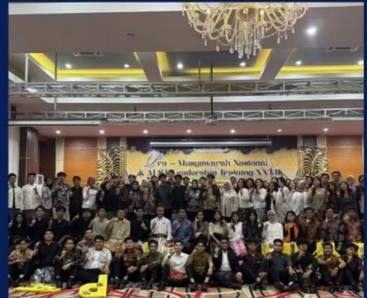
Pra-Musyawarah Nasional & ALSA Leadership Training (PALT)

National Seminar focuses on legal issues, involving 200 ALSA Indonesia members, invited guests, and the general public.