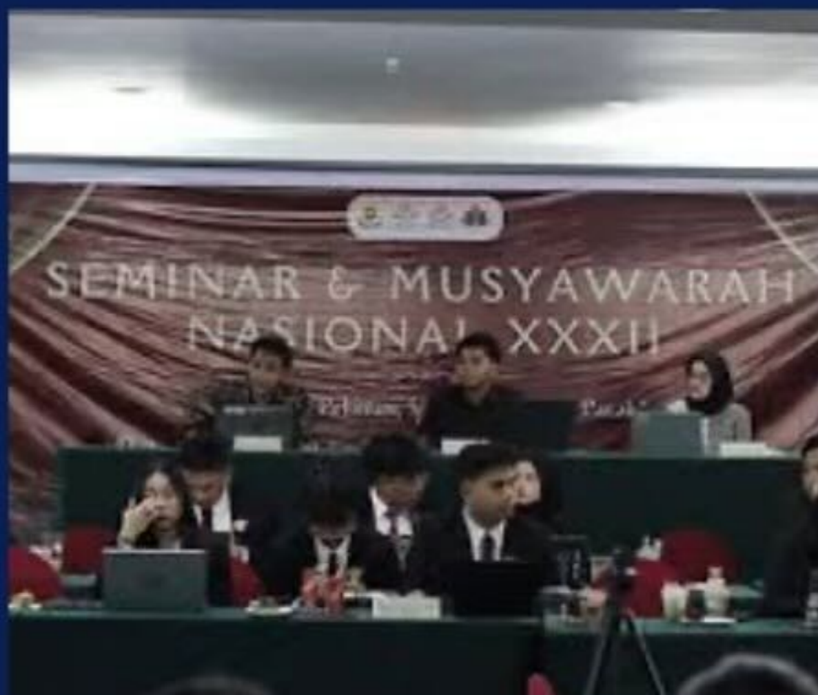
Seminar Musyawarah Nasional (Semunas)

Seminar Musyawarah Nasional is an event held at the end of the ALSA Indonesia National Board's term, featuring two main agendas. The first agenda is a public seminar discussing legal issues, open to the general public. The second agenda is the National Assembly, where the current ALSA Indonesia leadership presents their accountability report, and new leaders for the next term are elected.