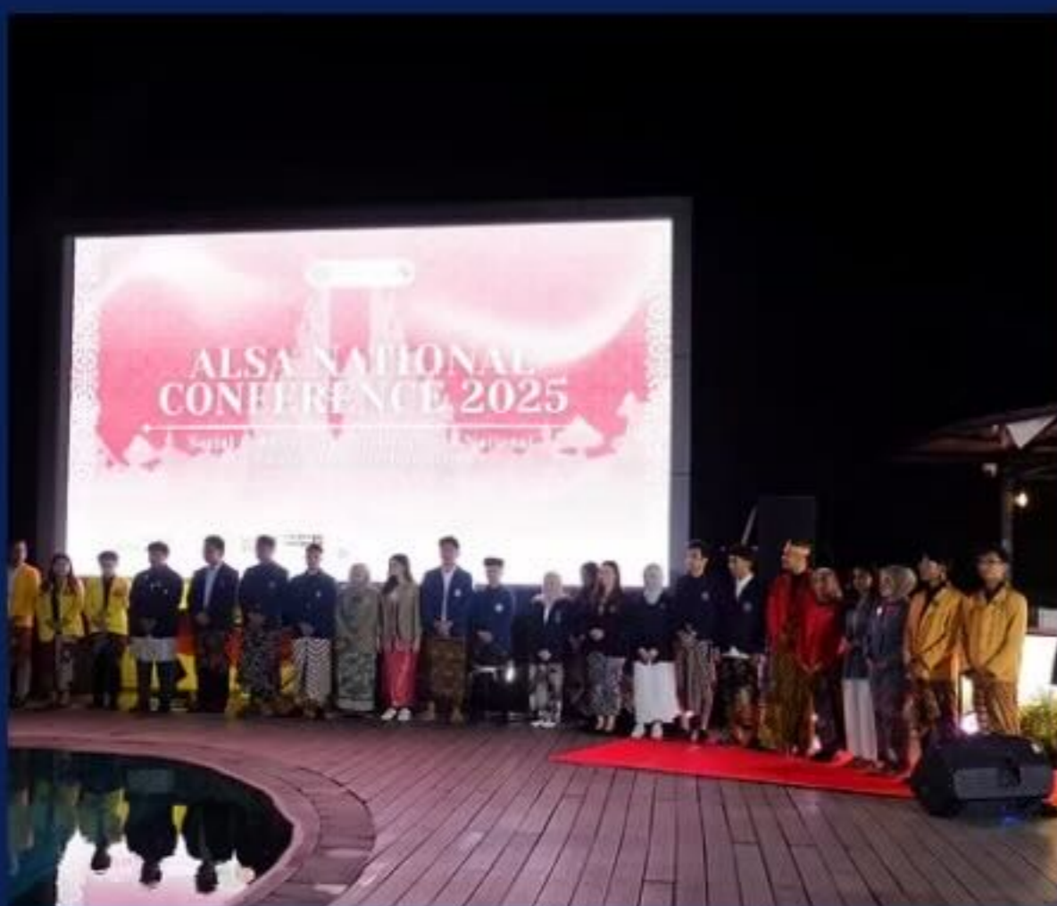
ALSA National Conference (ANC)

ALSA National Conference is a national event organized by ALSA Indonesia, featuring two main components: seminars and workshops. The seminar series is attended by ALSA Indonesia members, invited guests, and the general public to discuss current legal issues. Following the seminars, workshops are held exclusively for ALSA Indonesia members, providing a more focused and interactive experience.